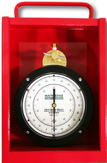
Mini Weight Indicator in Steel Box