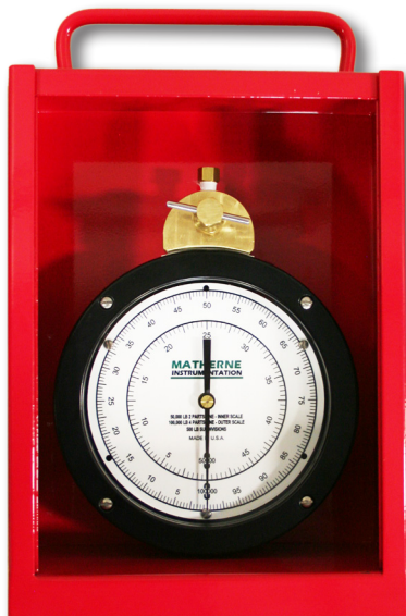
Mini Weight Indicator in Steel Box