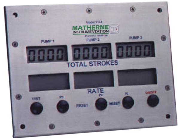
Model 1134 Three-pump Digital Stroke Rate Meter

The Digital Stroke Rate Meter System can be supplied in various configurations depending on customer requirements. Packages can be quoted with or without cables and/or junction boxes, depending on the need for an installation that will be permanent or be broken down for moving from site to site. This system can be combined with other Matherne Instrumentation/Innovative Electronics packages for complete consoles containing both hydraulic and electronic gauges and instruments, including computer systems.