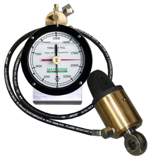
6" Tong Line Pull Gauge Box Mount with hose and Tension Piston Load Cell