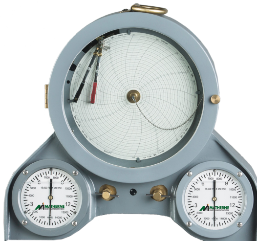
12" Circular Chart Recorder, Portable, with 5" Pressure Gauges