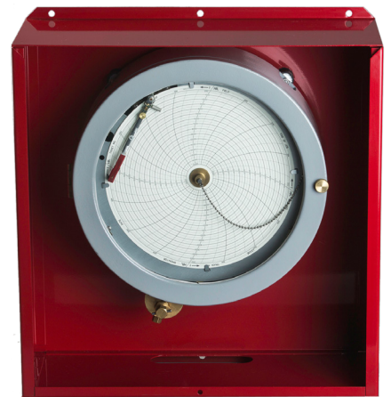
12" Circular Chart Recorder, Box Mount