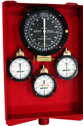
FS Weight Indicator

Matherne Instrumentation's anchor type weight indicator system is designed to give accurate readings of hook load and weight on bit. The system is designed to work with all major deadline anchors using a tension or compression loadcell.