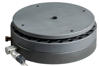
Compression Load Cell