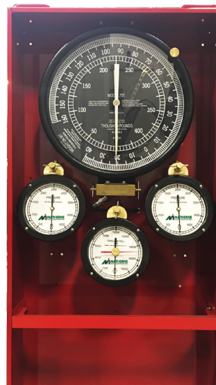
Driller's Box with Anchor Type Weight Indicator