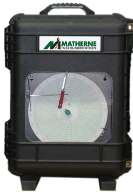
8" HD Chart Recorder

Matherne Instrumentation's "HD" Heavy-duty line of chart recorders are an accurate and reliable means for the measurement and recording of pressure in a variety of applications.