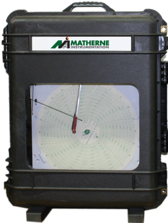
12" HD Chart Recorder