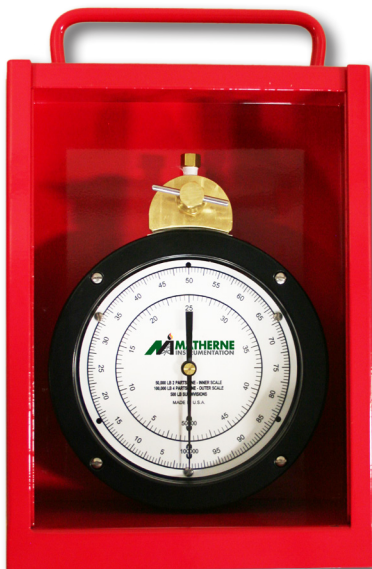
Mini Weight Indicator in Steel Box