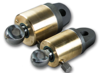
Tension Load Cell