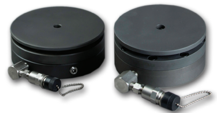
Compression Load Cell