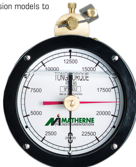
6" Power Tong Gauge Box Mount