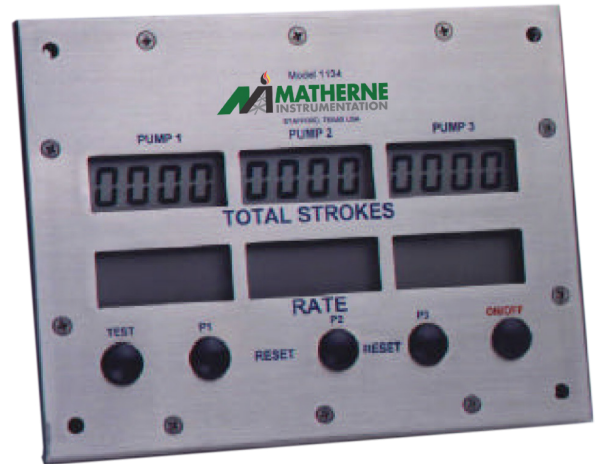
Model 1134 Three-pump Digital Stroke Rate Meter

The Digital Stroke Rate Meter System can be supplied in various configurations depending on customer requirements. Packages can be quoted with or without cables and/or junction boxes, depending on the need for an installation that will be permanent or be broken down for moving from site to site. This system can be combined with other Matherne Instrumentation/Innovative Electronics packages for complete consoles containing both hydraulic and electronic gauges and instruments, including computer systems.