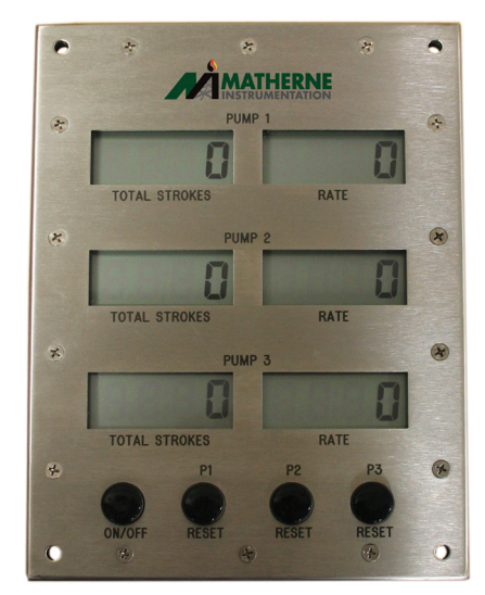
Model PS106 Three-pump Digital Stroke Rate Meter

The Digital Stroke Rate Meter System can be supplied in various configurations depending on customer requirements. Packages can be quoted with or without cables and/or junction boxes, depending on the need for an installation that will be permanent or be broken down for moving from site to site. This system can be combined with other Matherne Instrumentation/Innovative Electronics packages for complete consoles containing both hydraulic and electronic gauges and instruments, including computer systems.