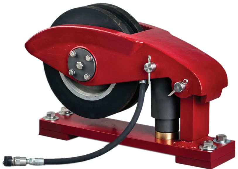
Rotary Torque Idler Assembly