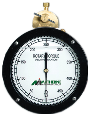
6" Rotary Torque Gauge Box Mount