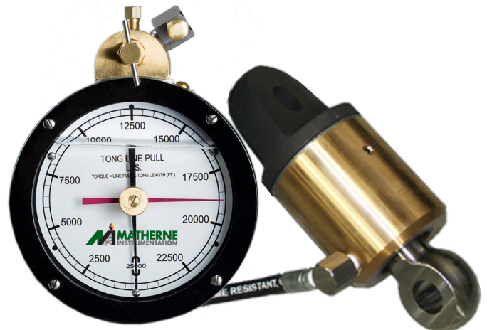
6" Tong Line Pull Gauge Box Mount with hose and Tension Piston Load Cell