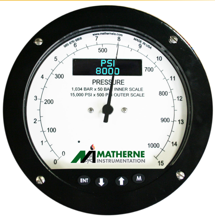
6-inch Electronic Pressure Gauge